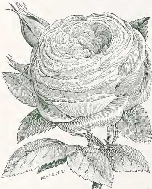
MAGNA CHARTA ROSE